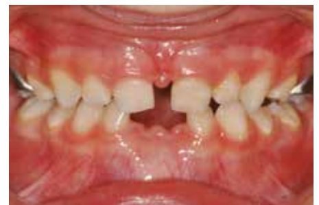
Figure 5b On the fourteenth day we terminated activation as the pre-determined expansion level of 5.5 millimeters had been reached

the tongue into a low, forward position, with a subsequent open bite from lingual dysfunction. As well as maintaining the breadth obtained with the rapid expander, the Quad helix can also increase it, by activating it by the required amount. Thanks to the lingual marker together with the modest encumbrance to the palate offered by the Quad helix (note its modeling in the photo), myofunctional re-education can be initiated immediately. This is definitely more important, in terms of the stability of the expansion and the prolonged use of the expander as a maintenance guard, given that the