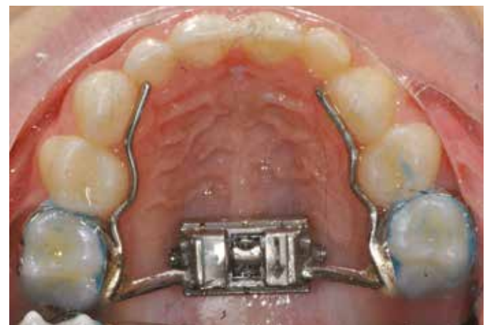
Figure 4a / 4b The expander was bonded to two bands and cemented onto the second deciduous molars