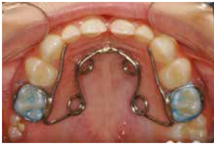
Figure 6 The expander remained blocked in the mouth for one month and was then replaced with a Quad helix

size of the Leonardo Expander; permitting effective and safe use in very young Patients. The arm and the screw of the Leonardo Expander were proven to be precise and without any flexion. The reference notches printed on the screw enabled the Clinician to check that the