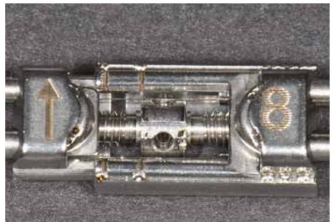
Figure 2a Screw activated at 4mm